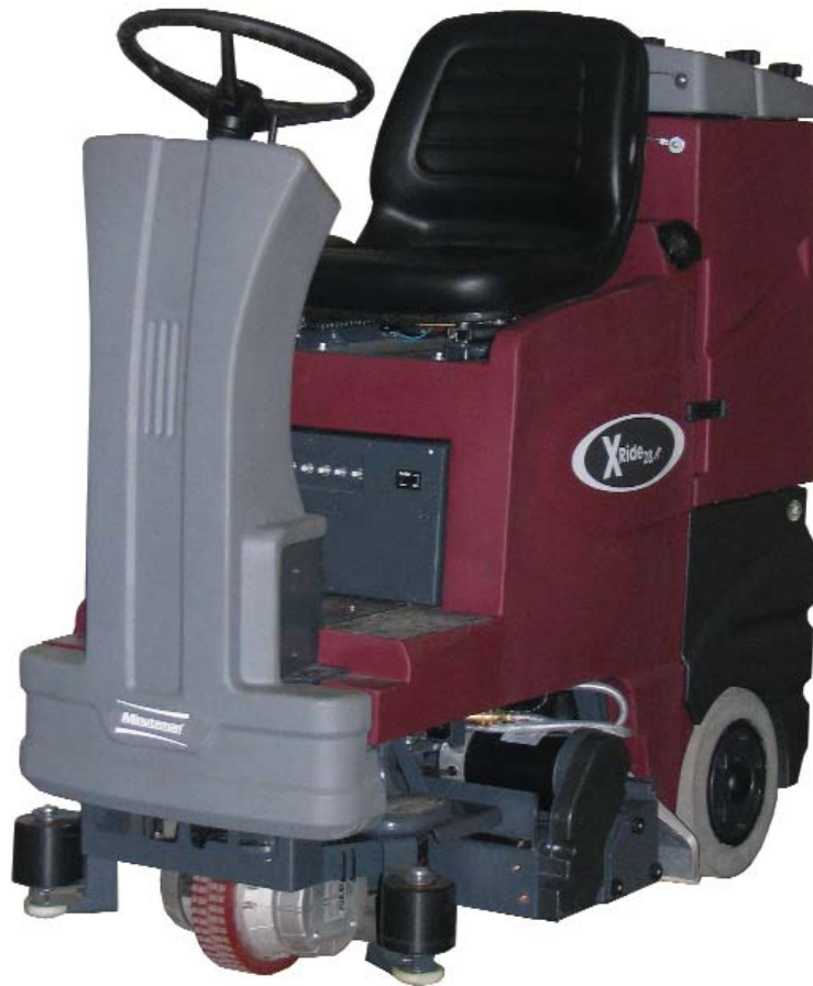
X Ride 28 28" Rider Carpet Extractor