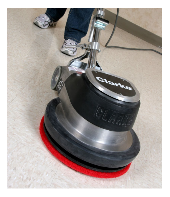
The FM Series floor polishers provide the highest in quality and durability.