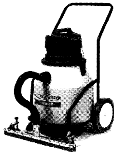
Model shown: #85006 WDI2DLY w/#85200 optional squeegee kit.

*Please refer to Betco Equipment Price/Product Guide for complete equipment warranty information.