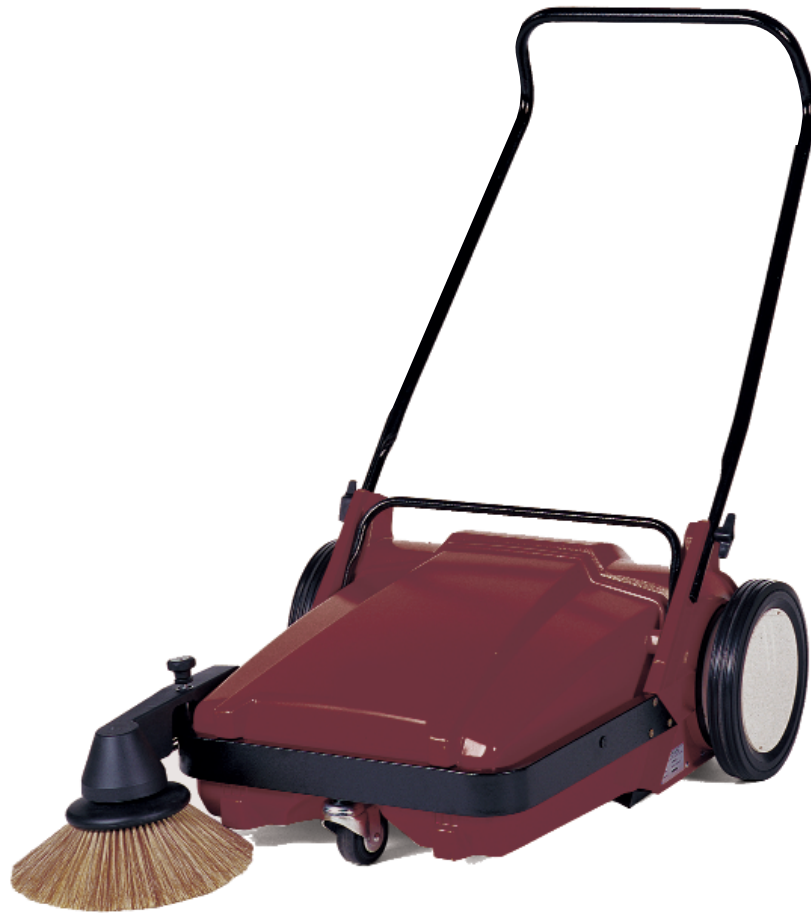
KS27M Walk-Behind Manual Sweeper